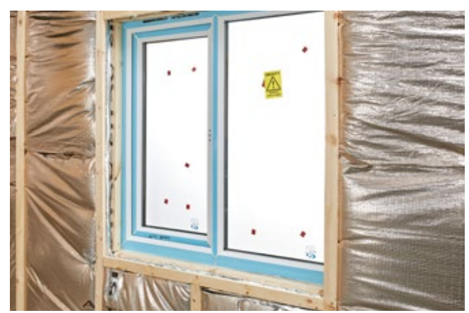
Secure with batten

For further advice from ACTIS call the technical department on 01249 462 888 or email solutions@insulation-actis.com