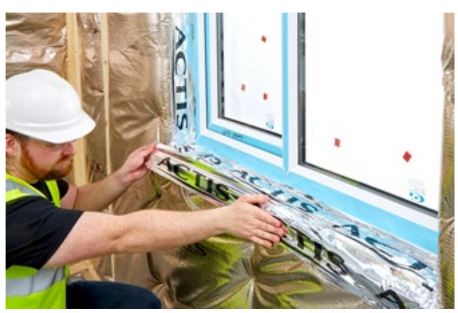
Seal around windows and doors