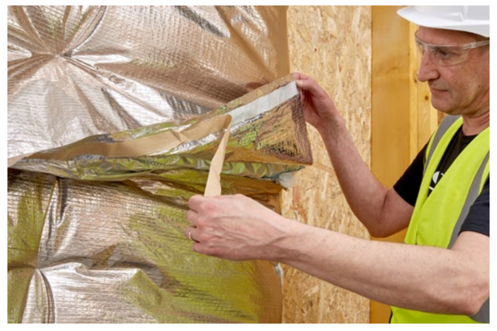
Overlap and seal with integral tape

Butt-join Eolis HC with the next layer of the product. Peel back the paper from the built-in self-adhesive tape and bring the entire overlap in contact with the lower layer sealing securely. Vertical joints are to be sealed with ACTIS tape which is recommended for the product.