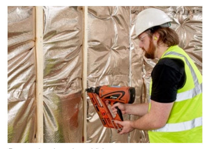
Prepare for plasterboard fixing

Prepare for plasterboard by fixing horizontal or vertical battens ((size in accordance with specification e.g. 25mm, 38mm, 50mm battens) nailing or screwing through Eolis HC to timber structure. Where joints between plasterboard sheets are unsupported, timber noggins should be installed.