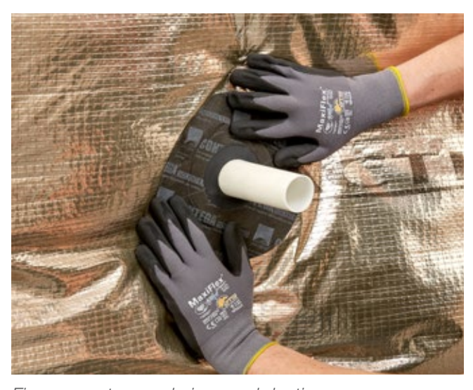
Fix grommet around pipes and ducting

For further information please contact ACTIS Technical Department.