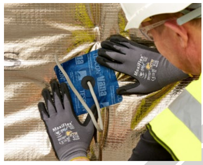
Fix grommet around electric wiring