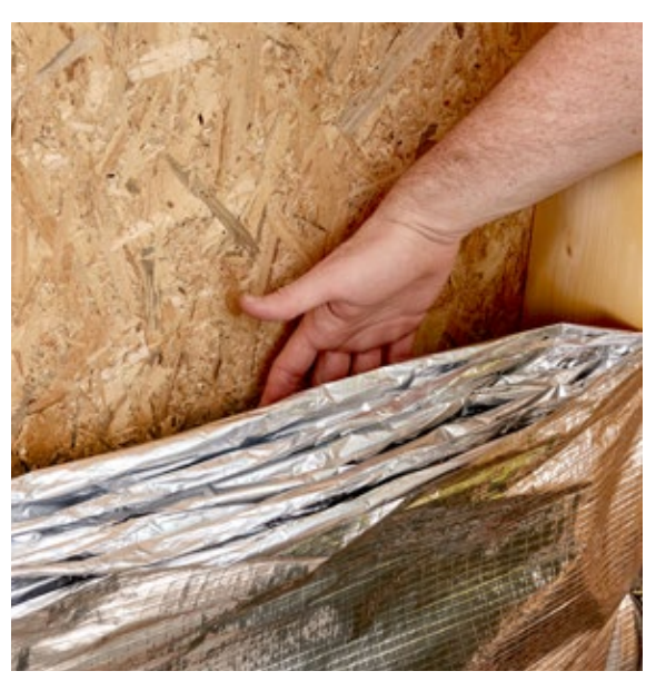
Install across timbers