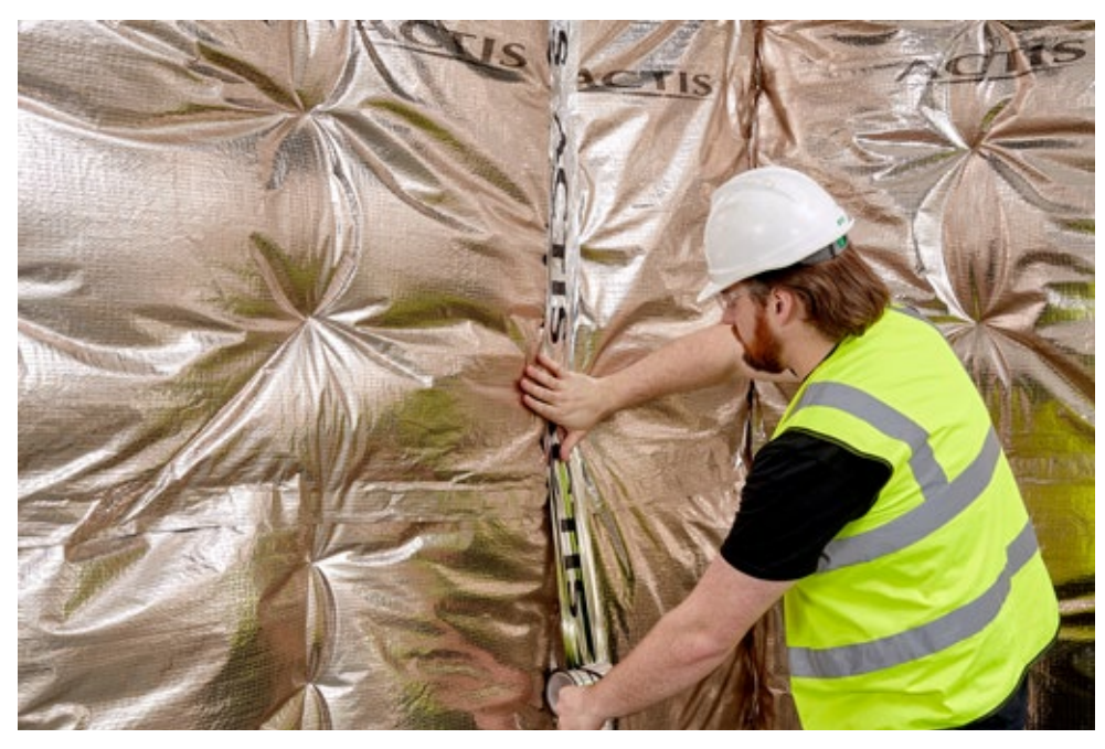
Seal with tape

All perimeter edges, including around windows and doors should be stapled every 50mm and secured with tape and battens.